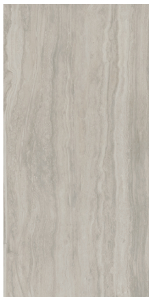
12x24 Unpolished WCXWBT05-12X24