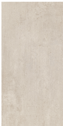
12x24 Unpolished WCXWBC01-12X24