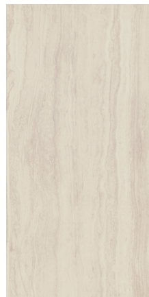
12x24 Unpolished WCXWBT01-12X24