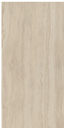
12x24 Unpolished WCXWBT04-12X24