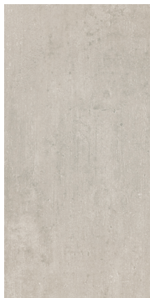
12x24 Unpolished WCXWBC05-12X24