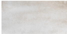
ALUMINA COLFDY10-12X24 COLFDY10-2X2MOS