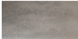
CAST NICKEL COLFDY20-12X24 COLFDY20-2X2MOS