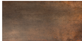
IRON OXIDE COLFDY40-12X24 COLFDY40-2X2MOS