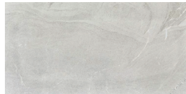
IVORY COL191-12X24 COL191-2X2MOS COL191-3X24BN